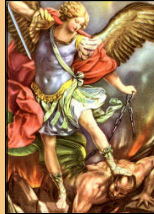
Saint Michael the ArchAngel

If you are hospitalized or home bound and in need of sacraments, please call the parish office.